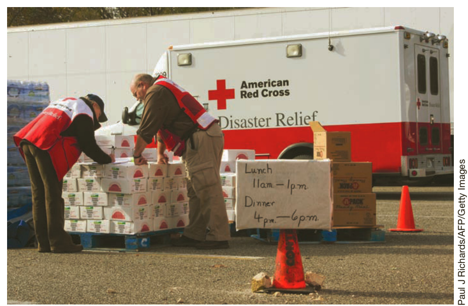
The Red Cross mobilized its efforts to respond to disaster on the East Coast after Superstorm Sandy struck.

Some not-for-profits sell merchandise or set up profit-generating arms to provide goods and services for which people are willing and able to pay. College bookstores sell everything from sweatshirts to coffee mugs with school logos imprinted on them, while the Sierra Club and the Appalachian Mountain Club both have full-fledged publishing programs. Founded in 1912, The Girl Scouts of the USA are known for their mouth-watering cookies. The organization has created a cookie empire valued at more than $700 million through sales by local scout troops.6 Handling merchandising programs like these, as well as launching other fund-raising campaigns, requires managers of not-for-profit organizations to develop effective business skills and experience. Consequently, many of the concepts discussed in this book apply to not-for-profit organizations as well as to profit-oriented firms.