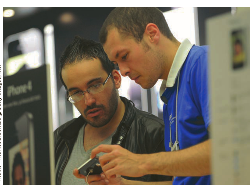
A business, such as this cell phone store, survives through the exchange between a buyer and a seller.

profits rewards earned by businesspeople who take the risks involved in blending people, technology, and information to create and market want-satisfying goods and services.