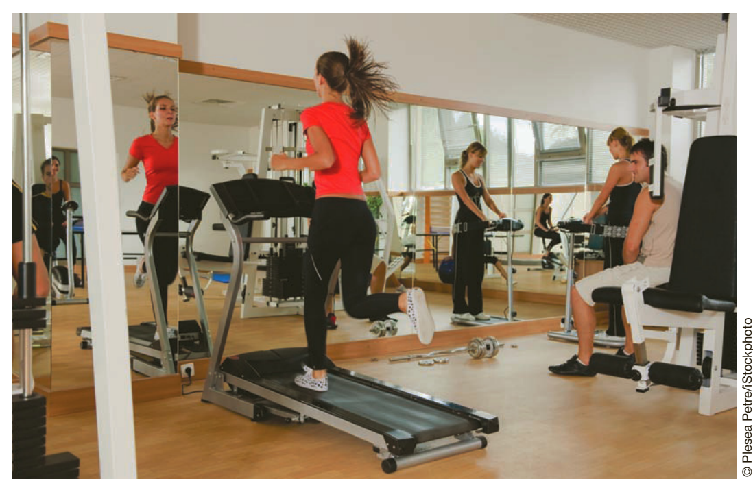
Competent, effective human resources can be a company's best asset. Providing benefits to those employees to retain them is in a company's best interest.

meetings. Others encourage creative thinking during company-sponsored hiking or rafting trips or during social gatherings. Effective, well-trained human resources provide a significant competitive edge because competitors cannot easily match another company's talented, motivated employees in the way they can buy the same computer system or purchase the same grade of natural resources.